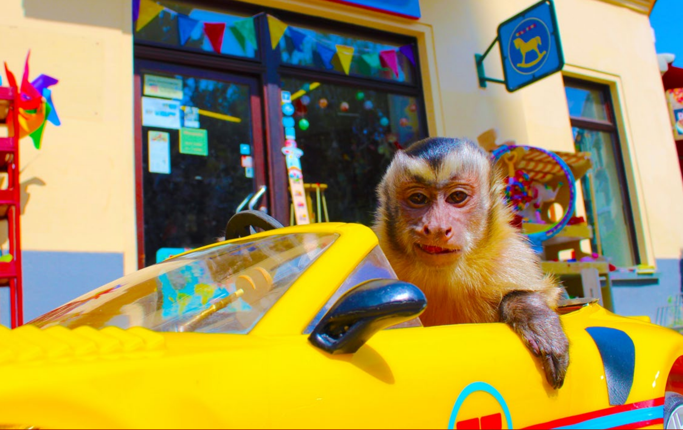
AKIKO, THE FLYING MONKEY